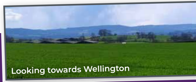
Looking towards Wellington