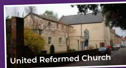
United Reformed Church