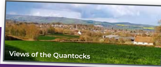
Views of the Quantocks