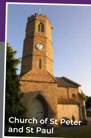
Church of St Peter and St Paul