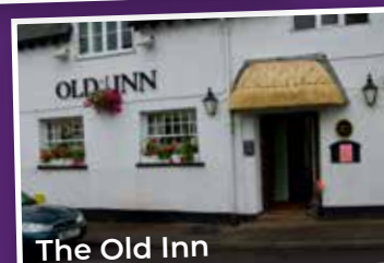
The Old Inn