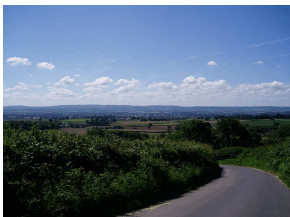
Near Vollis Cross

From the Meryan House Hotel go towards the church. After 0.13 miles turn left to go down Netherclay. At the end turn left onto Silk Mills Road (0.39 miles)