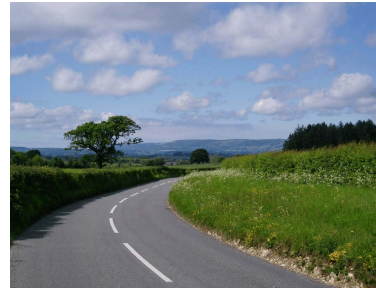
Road back to Trull

From the Meryan House Hotel go past the Post Office and butcher's shop along Bishops Hull Road to Wellington Road. Cross over into Comeytrowe Lane. Shortly after descend a hill and at the bottom turn left, signposted Trull, then immediately right.