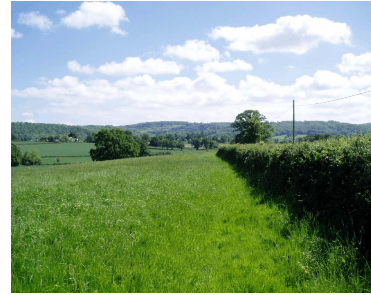
View from Fosgrove

From the Meryan House Hotel go past the Post Office along Bishops Hull Road. In 0.38 miles at the crossroads with Wellington Road go straight across into Comeytrowe Lane. After 0.41 miles at the bottom of the hill turn left then immediately right, signposted Trull.